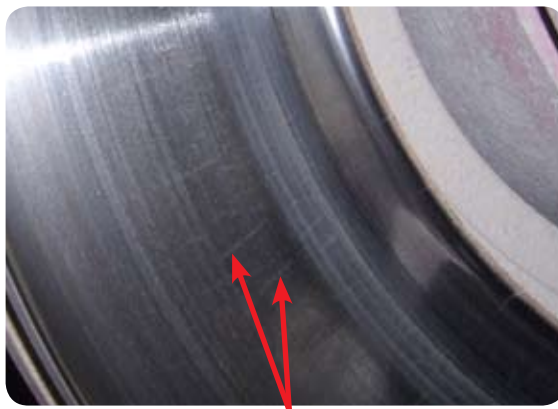
Minor heat cracking - acceptable

You can see the degree of cracking in the three photos shown. The cracking in the bottom left image is acceptable, but the two right-hand photos show excessive cracking and must be rejected.