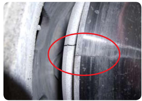
Cracking through rotor surface area - unacceptable