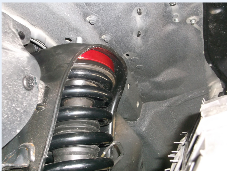
All strut spacers require LVV certification.

If presented with a vehicle which you're unsure about the legality of for a WoF inspection, contact the LVVTA Technical team by phone on 04 238 4343 or email on tech@lvvta.org.nz .