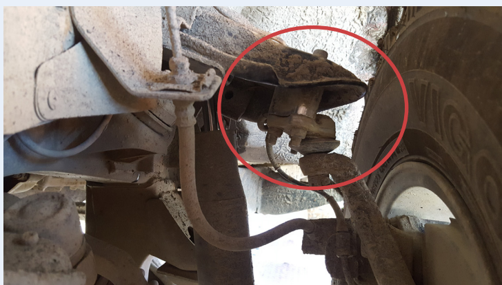
Ball joint spacers such as this increase the load on suspension arms, and as such are not suitable in all instances. LVV certification is required to confirm their suitability.