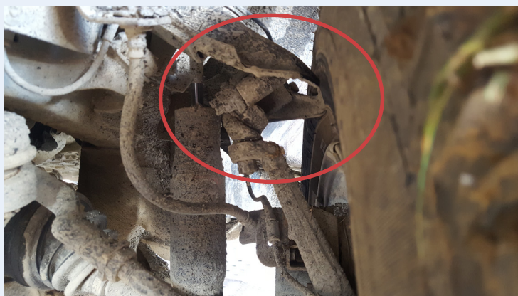
This upper suspension arm collapsed under the increased leverage being applied to it due to a ball joint spacer being fitted.