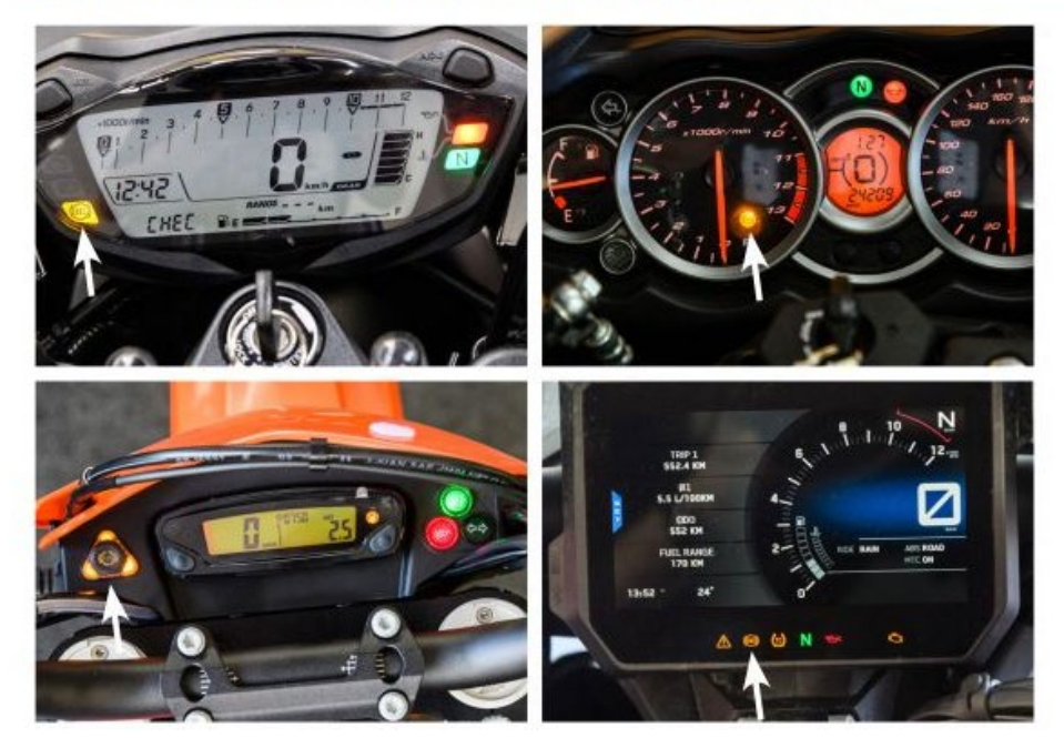
Figure 8-1-1. Examples of ABS warning light fault indication