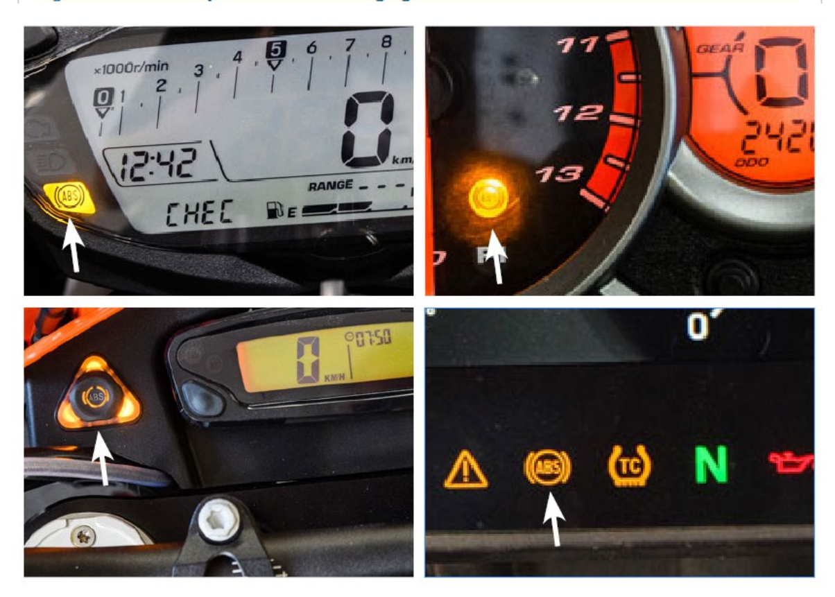
Figure 8-1-1. Examples of ABS warning light fault indication